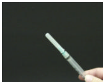
2. Scoop cap with end of needle so that the cap is sitting on the needle.