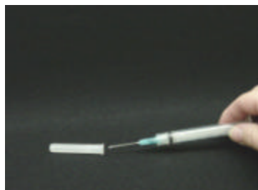
1. Place cap on hard flat surface.